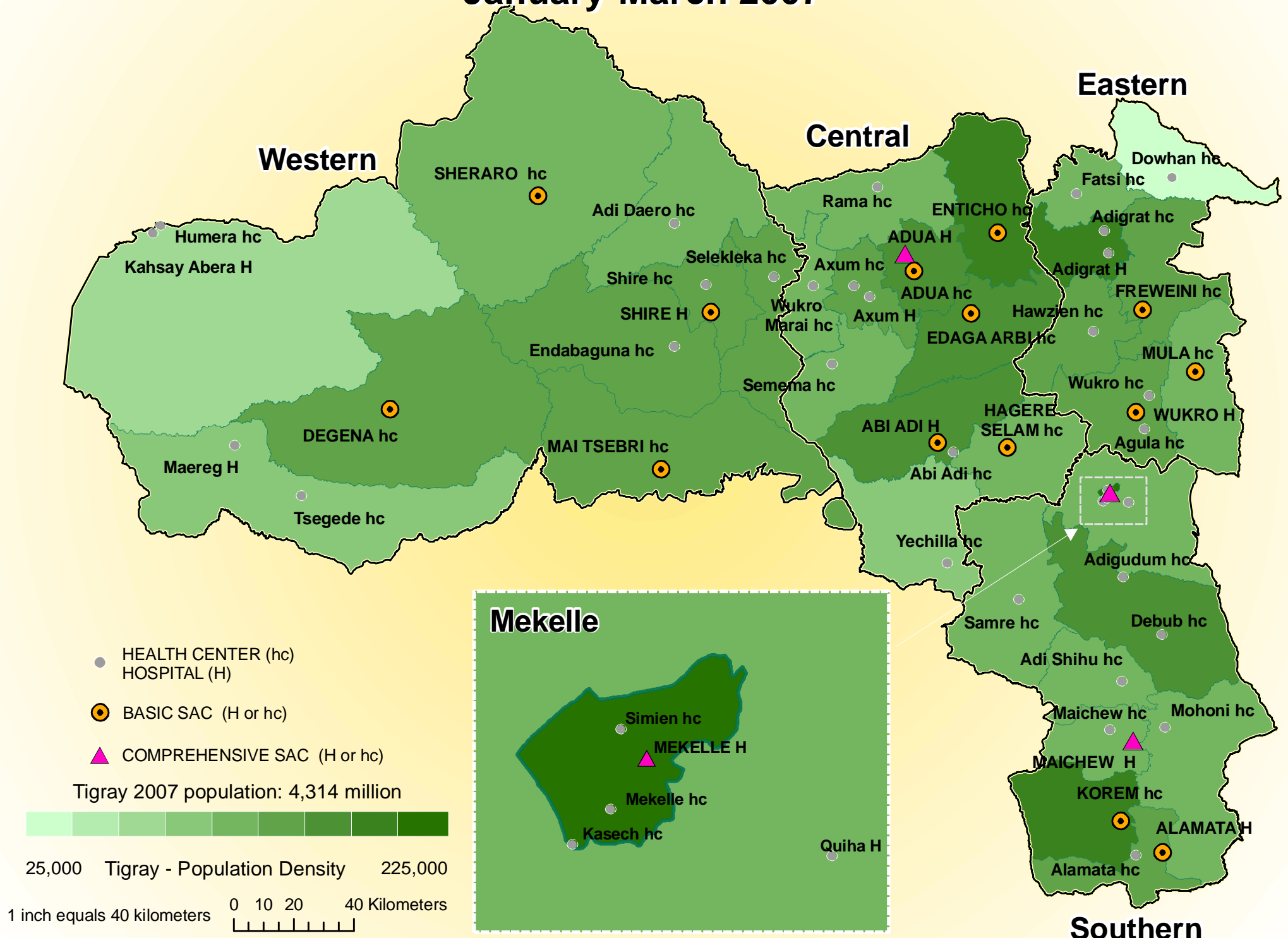
Figure 1: Distribution of public sector health facilities in Tigray, Ethiopia January-March 2007